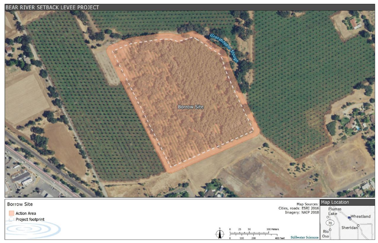
4) Borrow Area Map