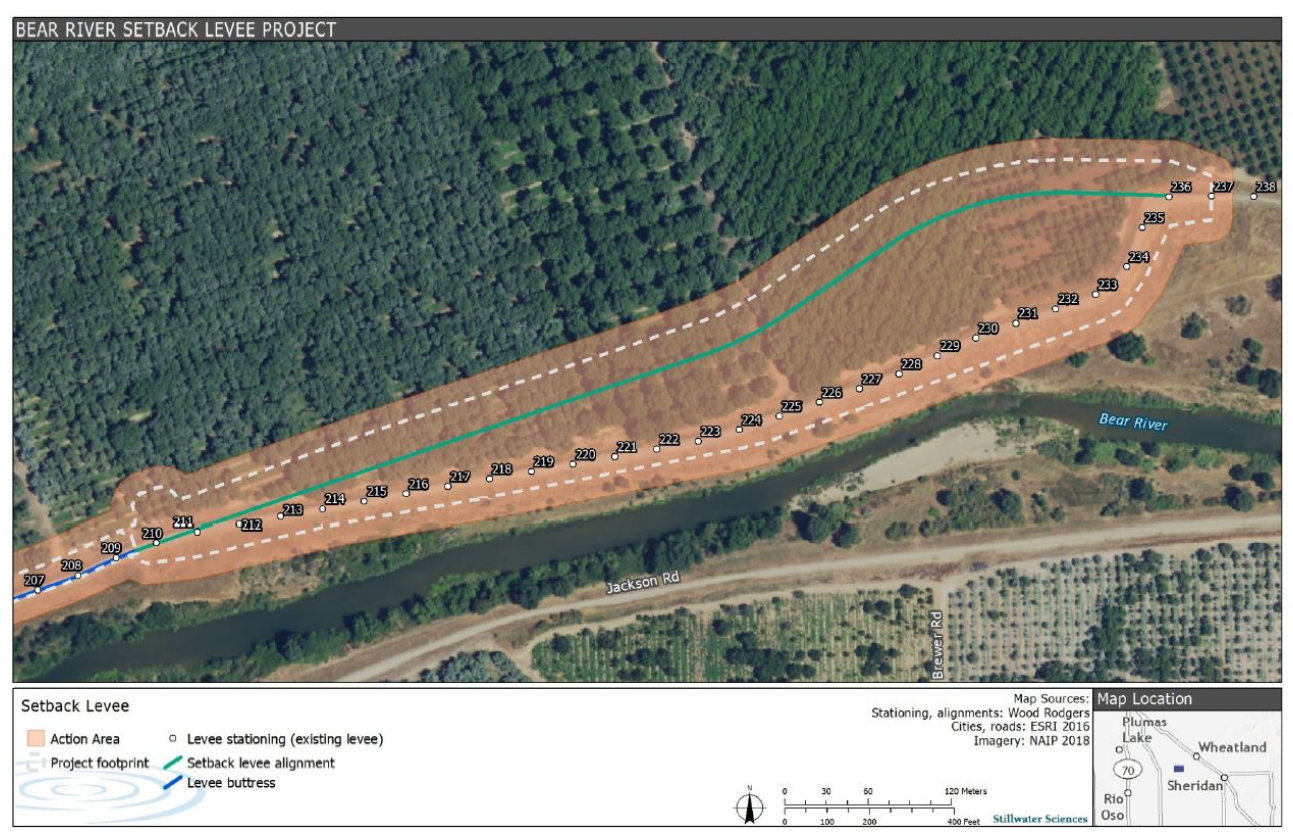
2) Action Area Map